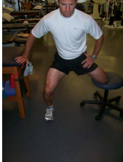
Hip Adductor Stretch with Stool