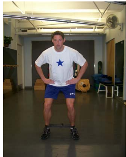
Side stepping with Theraband