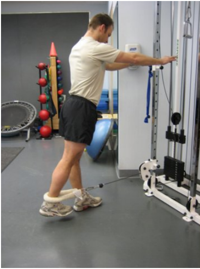
Cable Column Hip extension