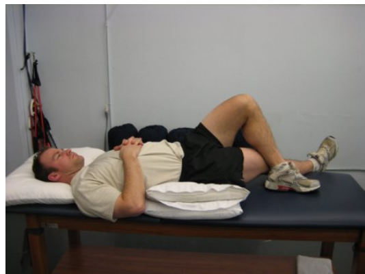
Combo Hip Flexor and It-band Stretch