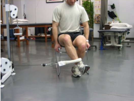
Cable Column External Rotation