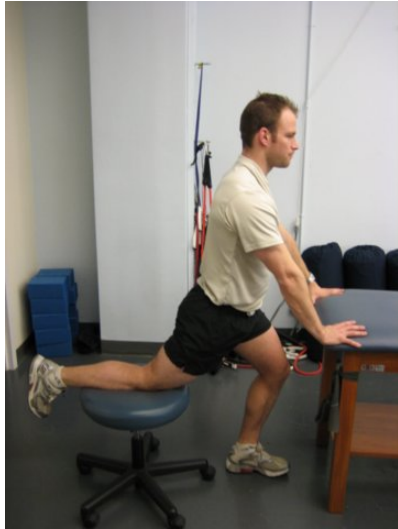
Hip Flexor Stretch with Stool