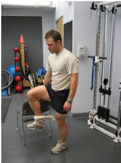
Cable Column hip flexion