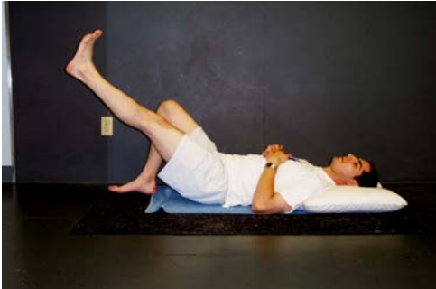
Straight leg raise