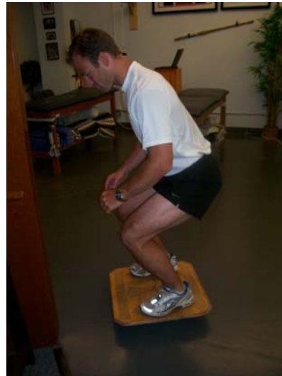
Mini squats on balance board or Bosu