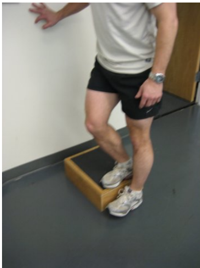
Step downs on step or Bosu