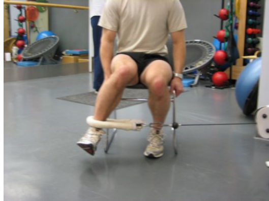
Cable Column Internal Rotation