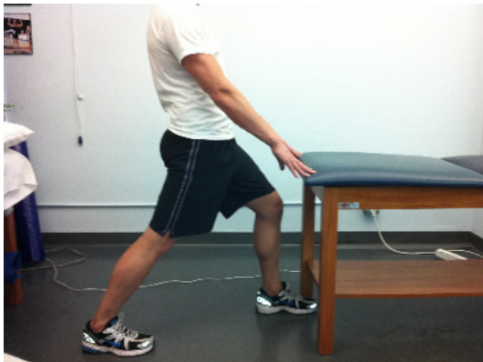
Standing Hip Flexor Stretch

Hip Adductor Stretch with Stool: Place involved knee on stool keeping hips parallel to table, then slide stool out to side until you feel a strong stretch in the inner thigh (groin). Hold for 30 seconds. Do 1 sets of 3.